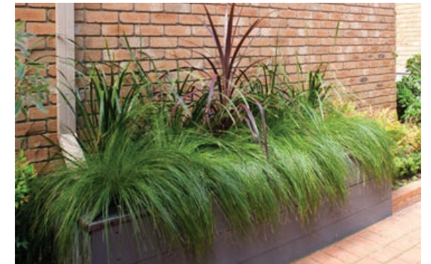
② PLANTER BOX WITH UNDERDRAIN