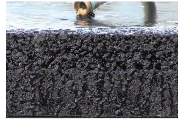
① PERVIOUS PAVEMENT