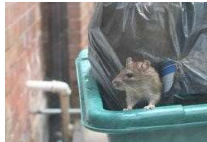
Rat in trash barrel with no lid and exposed trash bag