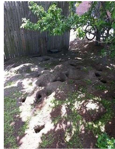
Rat Burrows in Yard