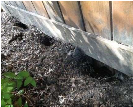
Rat Burrows beneath structures