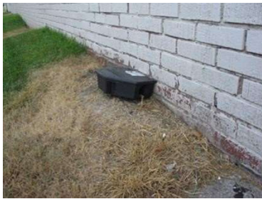
Bait Box along exterior wall