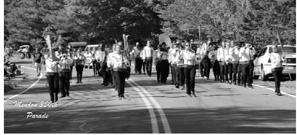
Nipmuc Regional High School Band