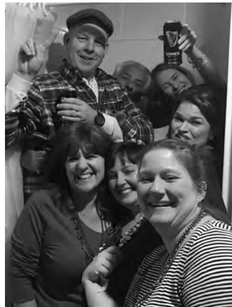
St. Paddy's Day Celebration Attendees