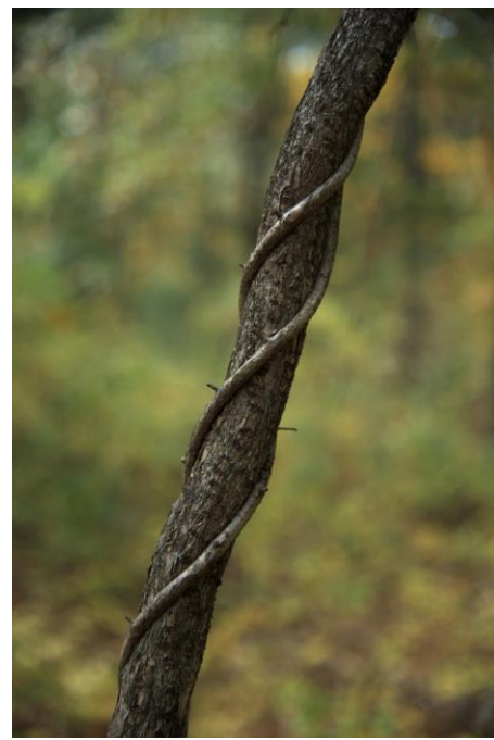
Bittersweet strangling trees in the Cox/Walker conservation land.

Massachusetts has been invaded by a foreign plant: oriental bittersweet ( Celastrus orbiculatus ). This vine grows fast in sunny areas, wraps itself around trees, and strangles them. In areas where bittersweet has taken hold, it kills our native trees and keeps new seedlings from growing.