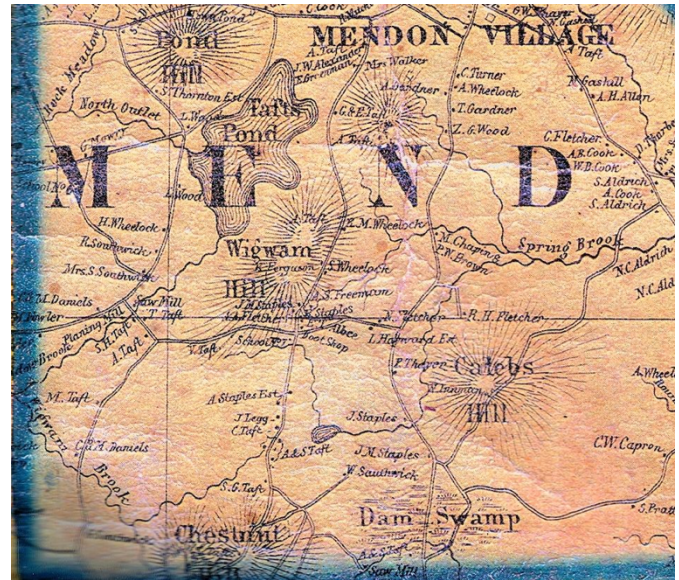
Detail of 1857 Map of Mendon Property at 91 Millville Street Labeled R Ferguson