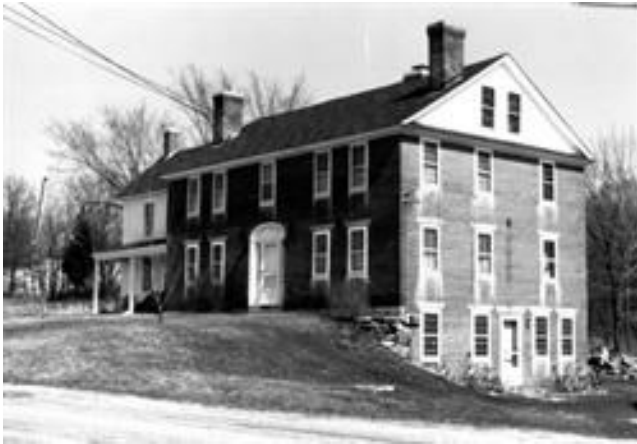
Taft, Arnold and Stephen House 166 Millville Rd Mendon