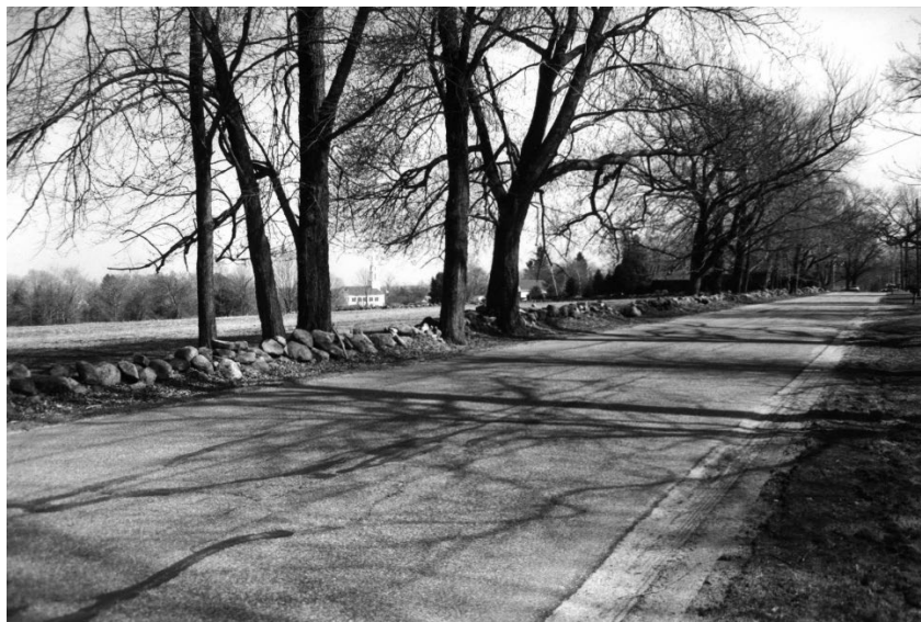
4. View south on Washington Street

In the 19th century, Washington Street was known locally as Birch Alley for the abundance of stand-alone birch trees that populated the street. Washington Street was later named for George Washington after his visit to Mendon in 1789. The period of 1830-70 saw the transformation of Mendon from primarily a landscape of loosely distributed farms around a meeting house to a modern commercial village. After a period of prosperity and growth through the mid-1800s, Mendon's development dropped off considerably until the very late 19th, early 20th centuries. Today's remaining Washington Street houses illustrate these factors. The house at 16 Washington c. 1750 is one of the few remaining examples of the town's original colonial landscape. The continued existence of peripheral farmland along Washington Street is a subtle but significant reminder of the antiquity of the town.