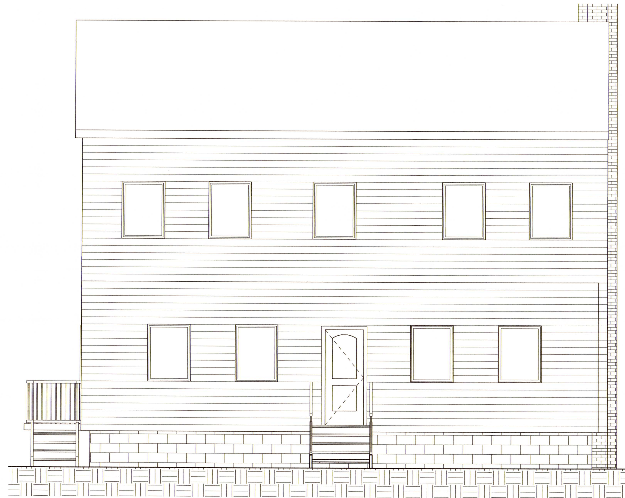
① Elevation 4 - a 1/4" = 1'-0"