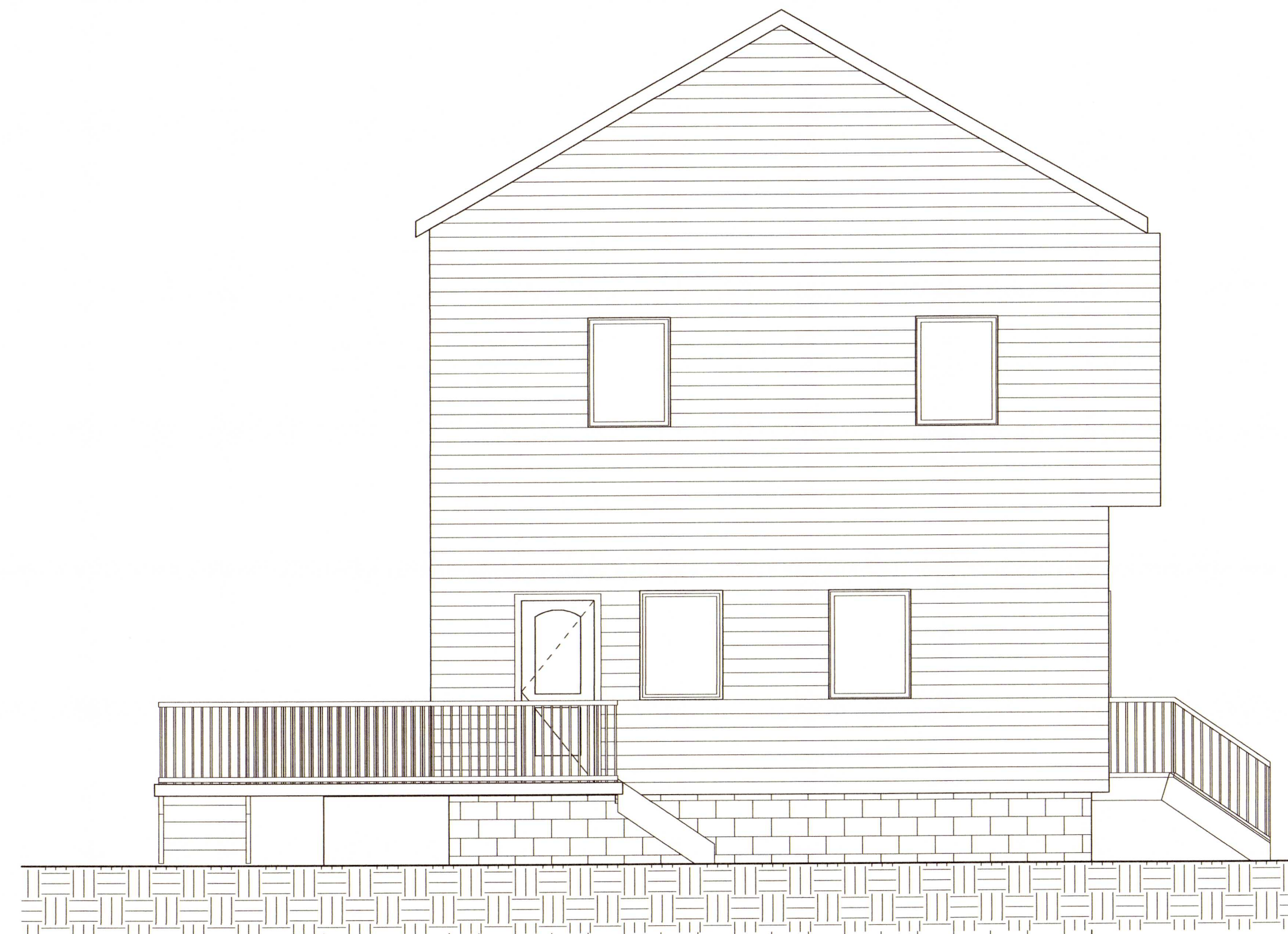
④ Elevation 8 - a 1/4" = 1'-0"