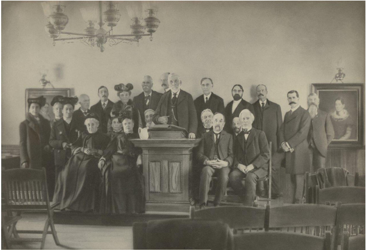
Mendon Historical Society-taken at Union Chapel, Mendon-later the Taft Public Library 1903