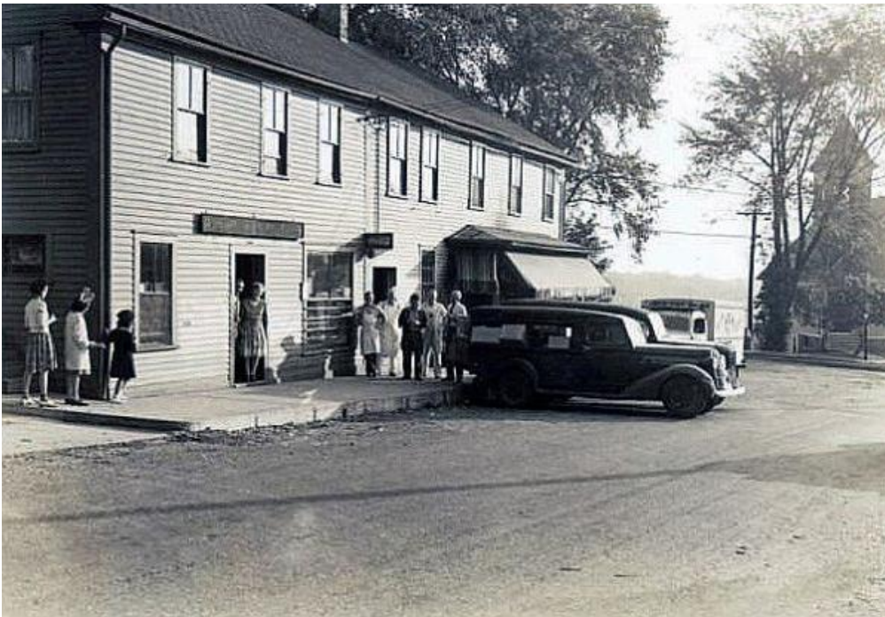
Barnes Provisions with the Union Chapel in the background (on right side)