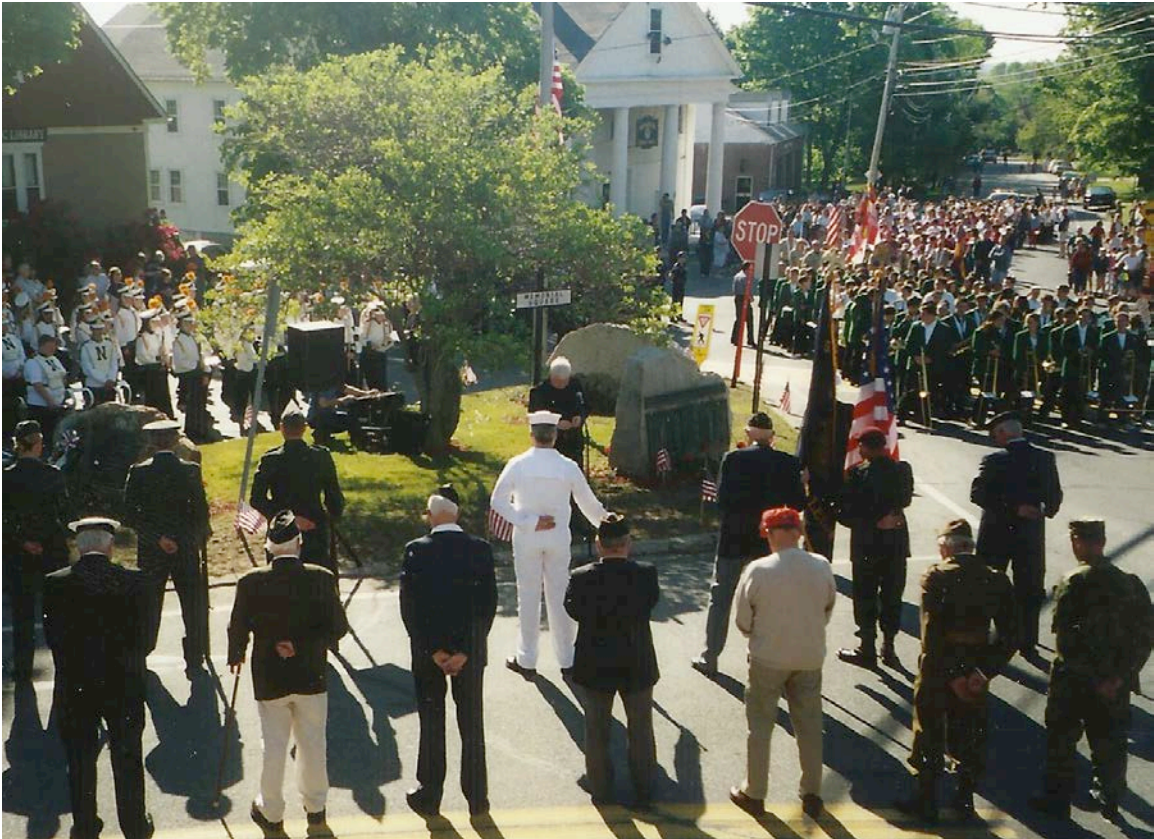
View of the Mendon Town Hall Campus Area