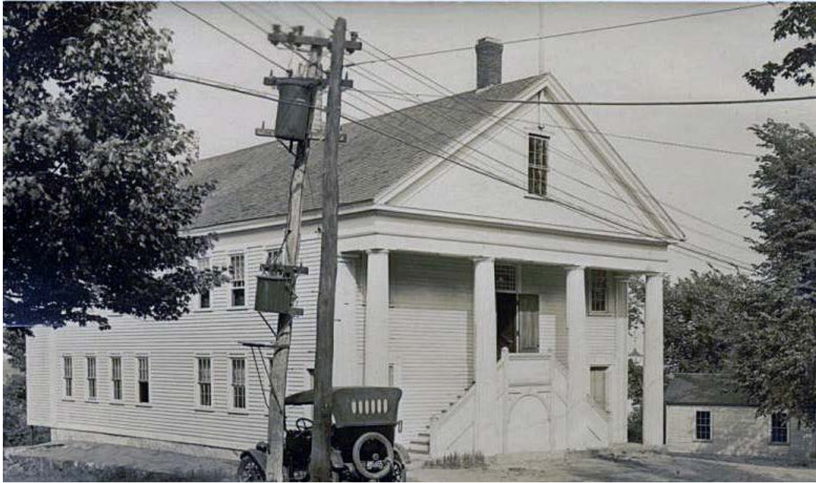
Harrison Hall (Mendon Town Hall) after removal of front staircase