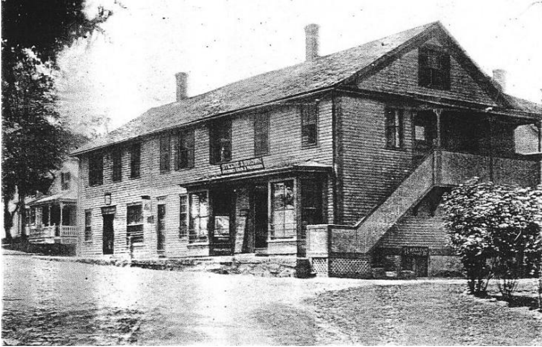
Maple Street View of Barnes Provisions

Images of Barnes Provisions / Danny's Variety / Post Office Square provided for Village Center context in terms of development of the Center and it's uses throughout history.