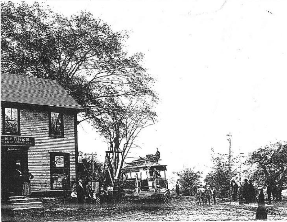
The Village Center Historic District The trolley passing in front of Barnes Provision Store and Post Office