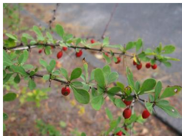
Close-up of leaves and berries

Leaf colors include yellow, green, purple and red; numerous varieties have been introduced for landscape planting. Japanese barberry has a dense, umbrella-shaped growth habit. Due to this, it creates a humid microclimate which ticks require for survival as they wait for a host. Areas with Japanese barberry infestations have nearly 60% more lyme-carrying ticks than areas where control measures have been taken.