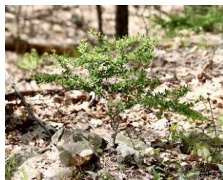
Young shrub in the forest

Japanese barberry readily spreads in open areas such as fields and abandoned lots, but is also shade-tolerant. Self-fertile, one plant is capable of spreading progeny. In addition to via berries, it can reproduce by rooting from the tips of arching branches that reach the ground, and by producing stems from the base of the plant and roots.