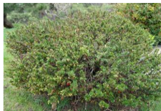
Mature Japanese barberry shrub

Japanese barberry is a spiny shrub ranging from 2 to 8 feet tall. In the summer it produces ¼-½ inch, ovular red berries that droop down from the twigs and can persist through the winter after its leaves have dropped. Leaves vary in size and shape, but tend to be small and oval to spatula shaped.