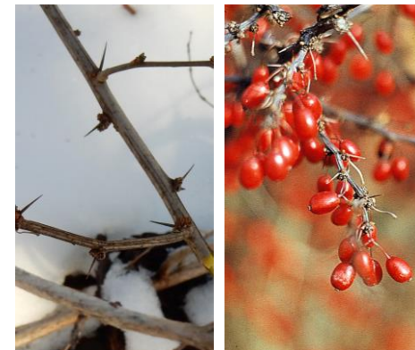
Close-ups of spines and berries

The leaves are alternating, grow in clusters along the branches, and are ovular or spatula-shaped. Their size can vary but are generally small (fingertip sized). Most diagnostic are the bright red ovular berries that are not palatable to people or wildlife. The spines are particularly visible in winter.