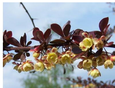
Japanese barberry in bloom

Japanese barberry is easily identified by the small dense spines and leaves, bright red oval elongate berries in the fall and winter, and the umbrella-like growth shape. It forms dense impenetrable thickets in unmaintained areas, but is commonly kept in a traditional round shape when maintained in landscapes. Sometimes kept as a hedge, cultivars range in color from dark purple, red, bright green, to near yellow.