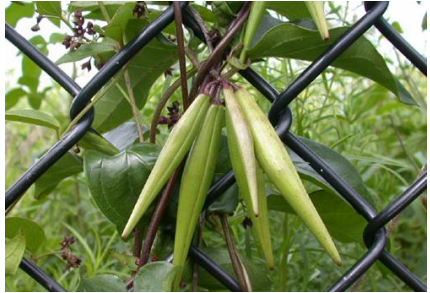
Fresh Black swallowwort seed pods

Flowers appear in early to mid-summer. They are small, about ¼” each, and dark purple to black color with fine white hairs. The smell resembles rotting fruit.