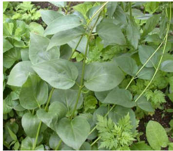
Black swallowwort leaves, stems, and closeup of flowers