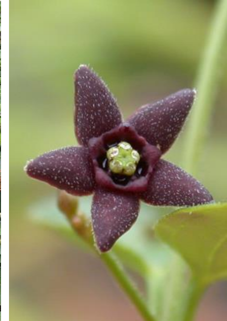
Black swallowwort showing vines, spent blooms, and seed pods, and a closeup of an individual blossom.

Groton has been invaded by a foreign plant: Black swallowwort ( Cynanchum louiseae ). This fast growing perennial vine quickly colonizes fields, fencelines, and disturbed areas. It forms dense mats that can smother native growth. It spreads rapidly via airborne seeds and is a major hazard for wildlife including Monarch butterflies.