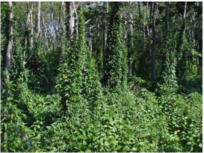
Mat-forming and tree-climbing

Black swallowwort outcompetes many native plants, by forming both dense mats and climbing trees and posts. Not only is this plant harmful to native plants and Monarch butterflies, it can be poisonous if eaten by wild herbivores or livestock. Simply put, this is one nasty plant.