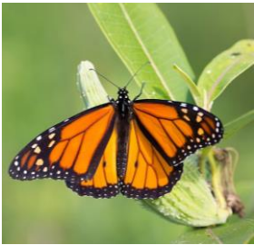
Monarch on native milkweed ( Asclepias )

Since Black swallowwort is in the milkweed family ( Asclepiadaceae ), it is attractive to Monarch butterflies, which are milkweed specialists. Monarch eggs and caterpillars are killed by this host, unlike our native milkweeds. Black swallowwort is actively harming a species already in trouble.