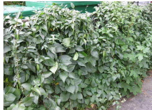
Black swallowwort on a fence in Somerville, MA

Black swallowwort is highly effective at spreading via fluffy seeds that are exposed when mature seedpods split. These seeds are spread by wind and animals. Thus, Black swallowwort is an able colonizer of disturbed areas such as cut fields, along fences, roads and trail sides.