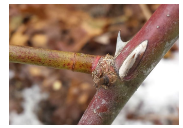
Close-up of thorns

Multiflora rose grows quickly and spreads by seeds, underground root systems or rhizomes, and by growing roots from the branch tips when they eventually reach the ground. It can also regenerate from cut stems and root fragments.