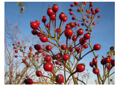
Multiflora rose hips

It bears clusters of small, white (occasionally pink) sweetsmelling flowers from May through June. The reddish fruit are \sim^{1/4} inch wide, round or oval, and persist in clusters on the plant from late summer through winter.