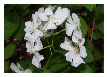
Multiflora rose in bloom

Multiflora rose has fringed hairlike growths at the base of its leaf stalks, a feature not found on other similar rose species.